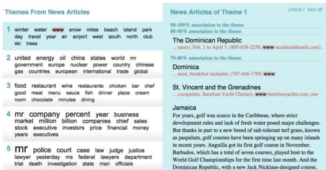
Figure 1. User interface for the interview study, showing the 20 topics extracted from a corpus of news articles. Topics were called “themes” during the study. There are two scrollable panels: the topics (left) and the documents associated with the currently selected topic (right). The documents are initially hidden, but shown as participants clicked the “unlock” button. Hovering over a topic word on the left highlights that word (e.g., “www”) in context for the displayed articles (red font) and highlights it in other topics if applicable. Clicking a document title toggles its full text.

Seven participants analyzed all 20 topics, while three participants only analyzed 9, 11 or 13 topics before the time elapsed. This resulted in 173 total topic assessments, and on average 8.7 participants ( SD = 1.4 ) assessed each topic. The audio was transcribed and coded. As exploratory work, we pursued an iterative analysis approach using a mixture of inductive and deductive codes (Braun and Clarke, 2006; Hruschka et al., 2004). For our primary focus of analyzing proposed topic model refinements, we created a codebook with 11 refinement operations based on topic