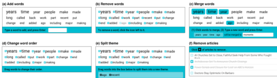
Figure 4. User interface implementation of the six refinement operations evaluated in the crowdsourced study, designed to support direct manipulation of topic words and documents. Participants had to first select an operation to view these tool details. Note that topics and documents were called “themes” and “articles” during the task.

Change word order was used in 76.7% of topics, with an average of 3.5 changes for each topic ( SD = 3.8 , Median = 2 ). Words were moved much more frequently to a higher probability position (81% of cases) than to a lower probability position. However, since participants focused on words near the top of the list (i.e., closer to rank 1), there was a significant negative correlation between the original word rank and the frequency with which a word’s order was changed (Spearman’s r_s = -.63, p < .003 ).